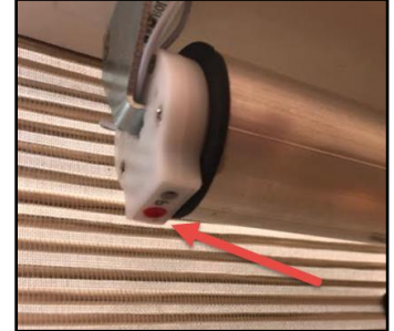
Reset Button – Natural Woven