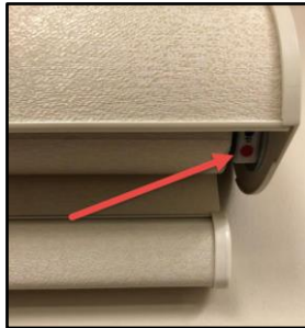
Reset Button – Shading/Dual