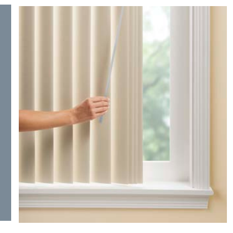
Moves the blinds/shades side-to-side across the window with a sturdy wand.