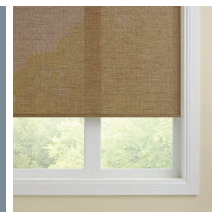
A light push or pull lifts or lowers shade to any desired position. There are no exposed cords.