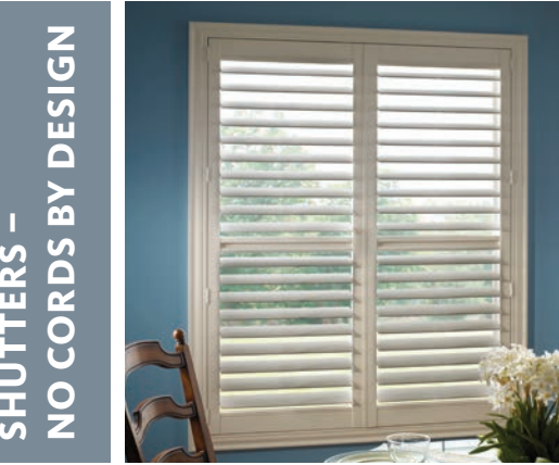
By design shutters are cordless, eliminating potential safety hazards posed by operating cords.