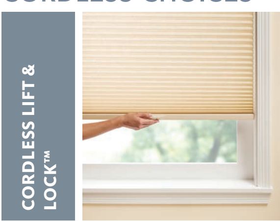
Press a button on the bottomrail handle to lift and lower the shade. Release the button to securely lock the shade into place.